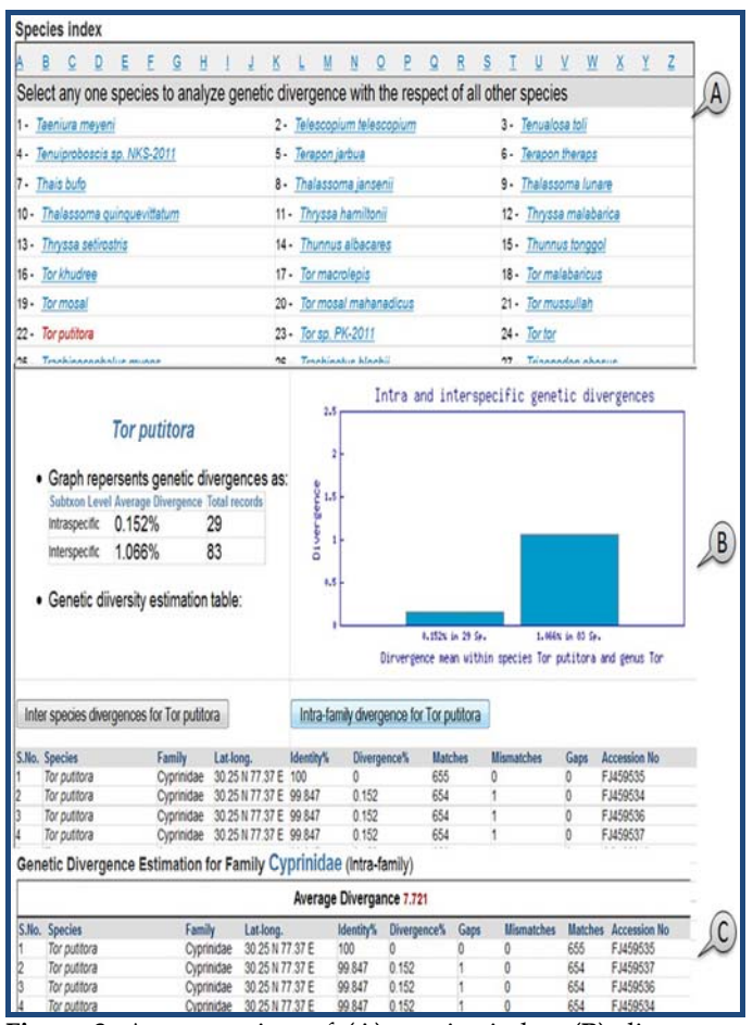
Figure 3: A screen view of (A) species index; (B) divergence estimation; (C) intra-family divergence for Tor putitora

reasons. The administrator of FBIS has full privileges for database administration and management of submission activities. Users may submit their data in FBIS by sending an email to the FBIS administrator, which will be verified before addition to the database.