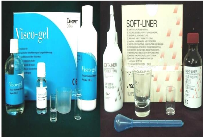
Figure 1. Visco-gel and GC soft liner