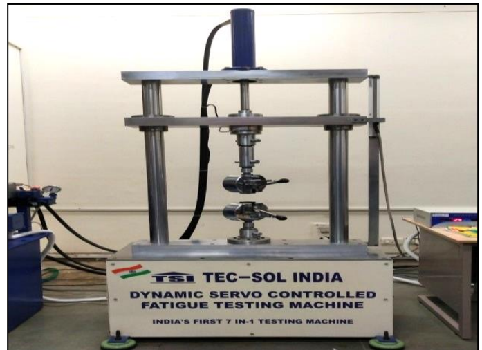
Figure 4. Universal testing machine